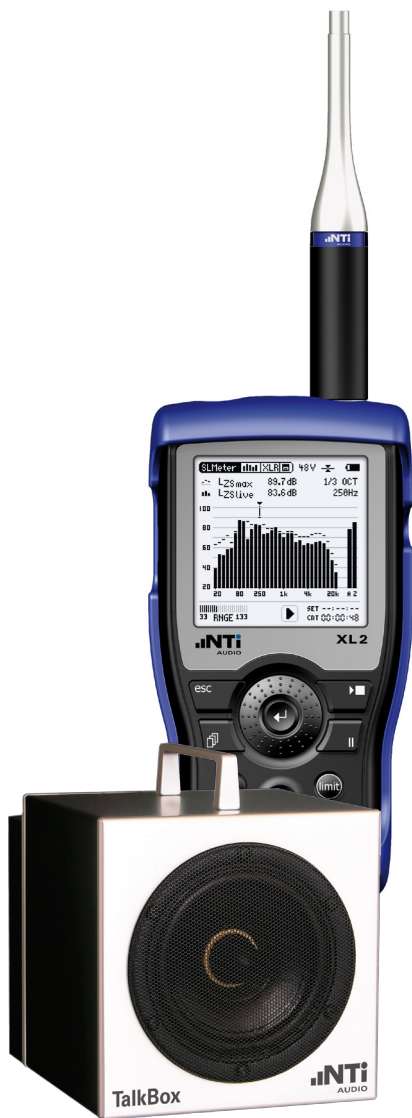
Exel Line: NTi Audio TalkBox with XL2 Audio and Acoustic Analyzer