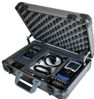
Exel Acoustic Set