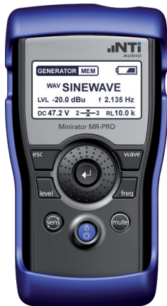
Exel Line: Minirator MR-PRO generates test signals