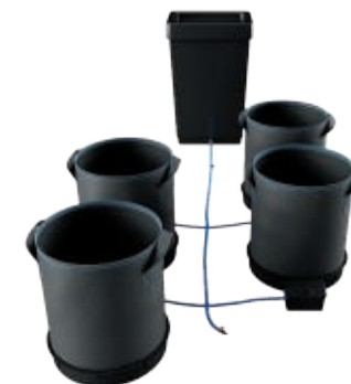
4Pot XXL 50 (50L pot - excl. adaptive collar)