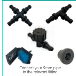
Connect your 9mm pipe to the relevant fitting