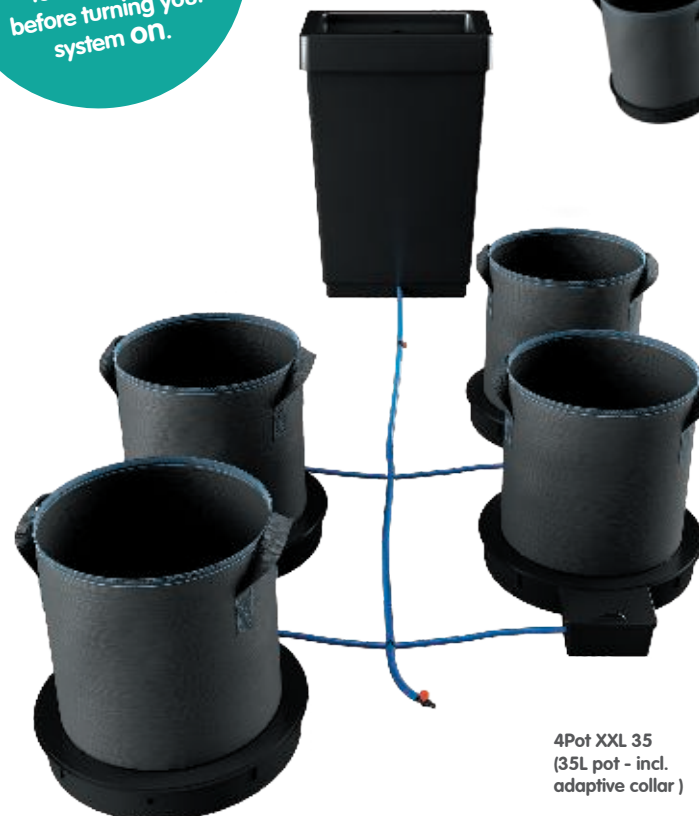
4Pot XXL 35 (35L pot - incl. adaptive collar)