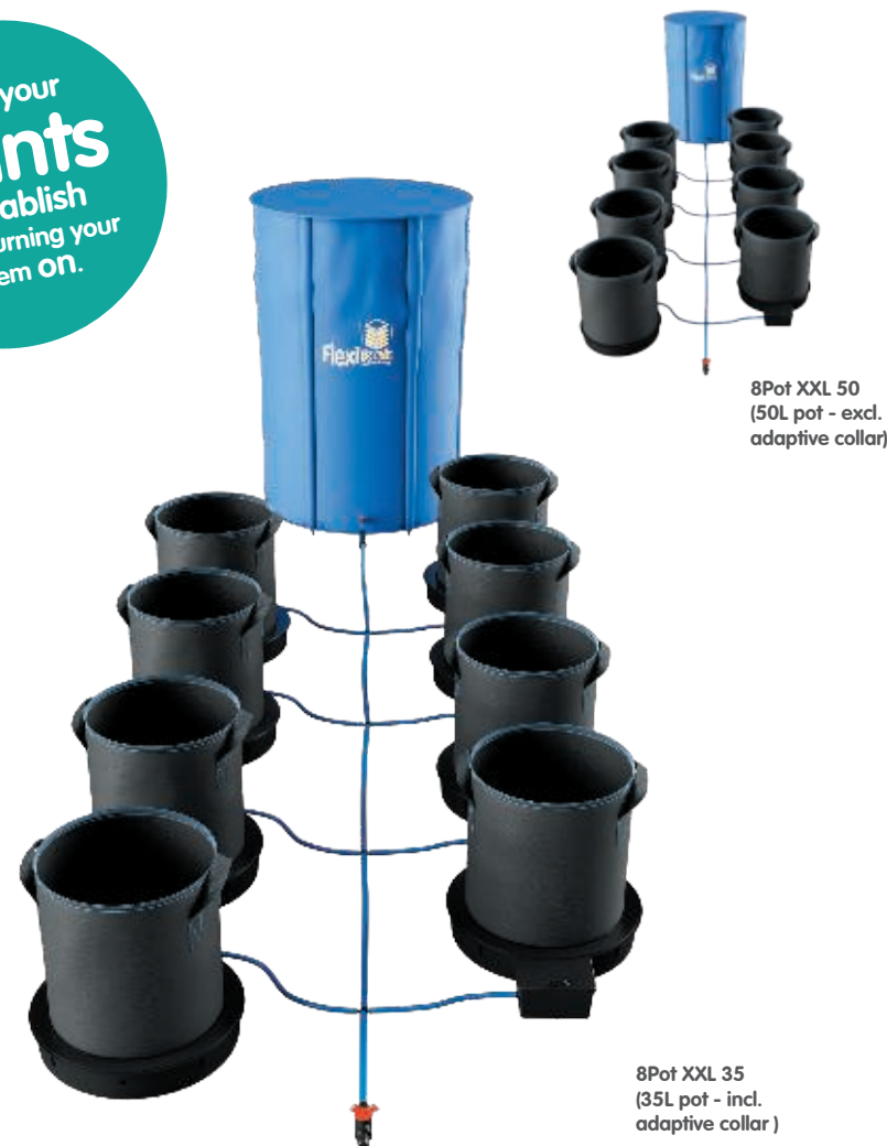
8Pot XXL 50 (50L pot - excl. adaptive collar)