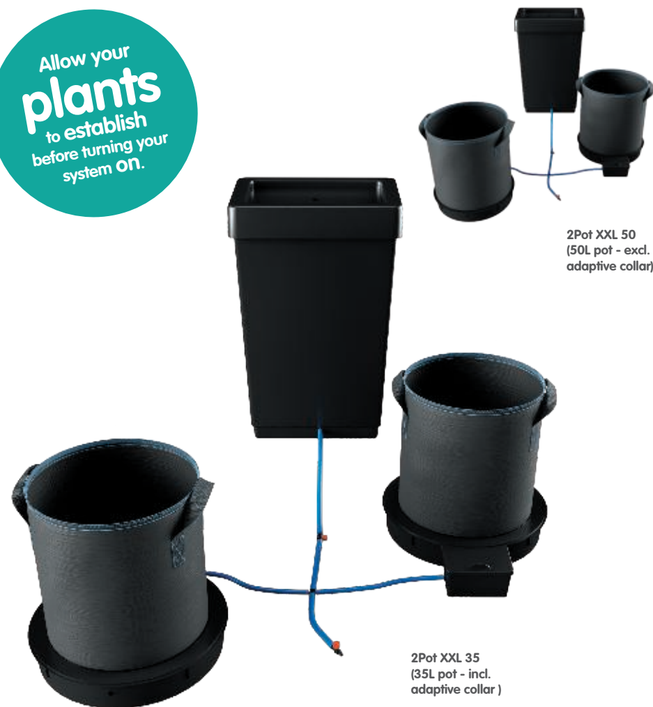
2Pot XXL 50 (50L pot - excl. adaptive collar)