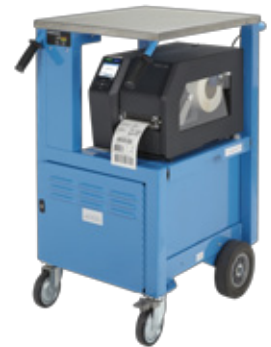
Powered Mobile Print Cart