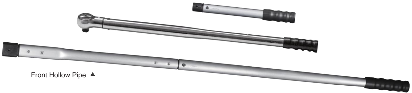
Front Hollow Pipe ▲