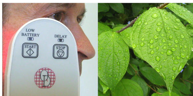
Fig. 3 Photograph shows irradiation of facial area with WARP 10, a devise originally developed for self-aid administration under severe battlefield conditions, for instance, pain alleviation [26] (left) and raindrops on leaves (right). Even without a superhydrophobic structure, the interplay between leaf position, raindrops, moderate hydrophobicity and gravity equips many plant leaves with an efficient self-cleaning program. The images provide means to combat emerging allergies, the left using advanced technology, and the right using nature.

in the face, naturally a manifestation of aging, potentially accelerated by environmental factors, is thought to be partially triggered by the progressive deposition of osmiophilic groups (polar amino acids, fatty acids and calcium salts) on elastin fibres [15] . Using an experimental model, we demonstrated that crystalline water layers perform on hydrophobic surfaces a lubricating function and reduce dissipative effects [9] . Their biological functions, including lubrication, have been envisaged by Szent Györgyi in 1971 [16] . Presumably, they are the key factor in maintaining the structural integrity of the elastin fibres, thereby granting their unique functionality. Whereas first results show a clear tendency of reduced wrinkle levels in response to the successively repeated irradiation, we observed as a manifest result of a change in the recurrent immune response.