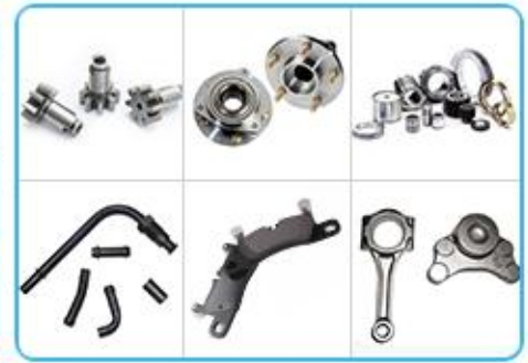
Auto parts applications