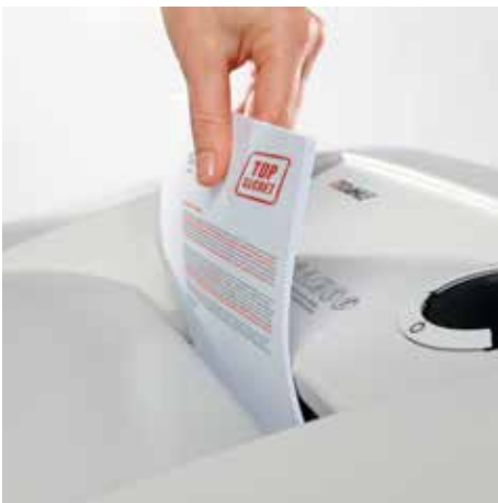
Innovative MHP technology® shreds up to 30 % more paper