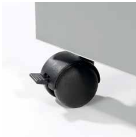
Practical swivel casters for flexible use