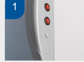
1. Independent light switches for inner light and canopy