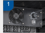
1. Inner assistance fan