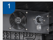
1. Inner assistance fan