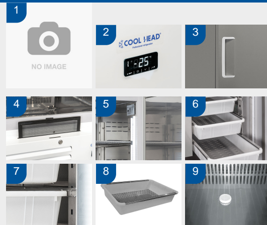
1. Pans with fish water drain tray (Antioxidation)