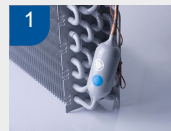
1. Evaporator with anti-corrosion treatment