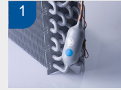
1. Evaporator with anti-corrosion treatment