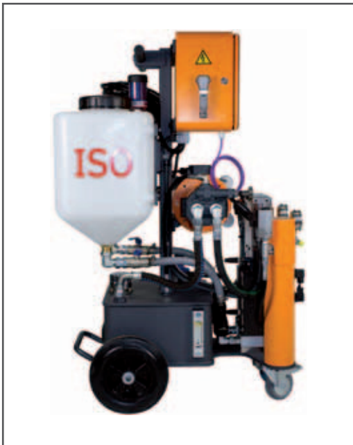
Easy Spray Hydraulic with hose heating

The control panel consists of a touch screen that incorporates specially designed software to facilitate the selection and control of all working parameters in quick and easy manner. A sophisticated alarm system warns the operation of any error in the process to ensure the right application of the products. As an additional feature, a phase connection alarm is incorporated into the design to avoid costly repairs from errors or mistakes when plugging the proportioner into the electrical supply.