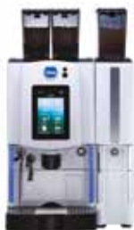
1 or 2 grinders Choco