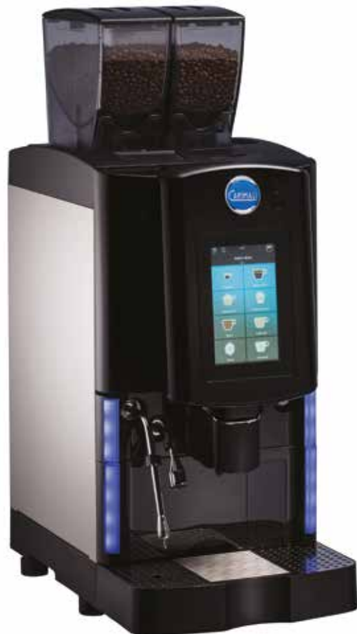
Optima Soft Plus