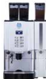
1 or 2 grinders Choco